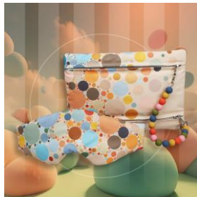
Production- ready design