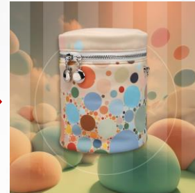
Production- ready design