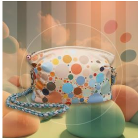
Production- ready design