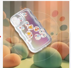
Production- ready design